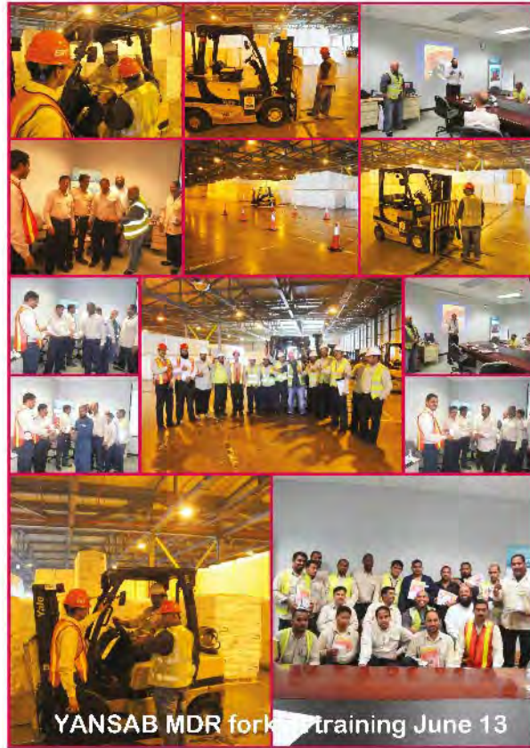
YANSAB MDR forklift training June 13

MDR SSHEQ Manager said about the achievement: "It's MDR's intention to continue with this type of educational campaigns and programs for all levels of workers to continually improve our organization's performance and to stay number one in the industry."