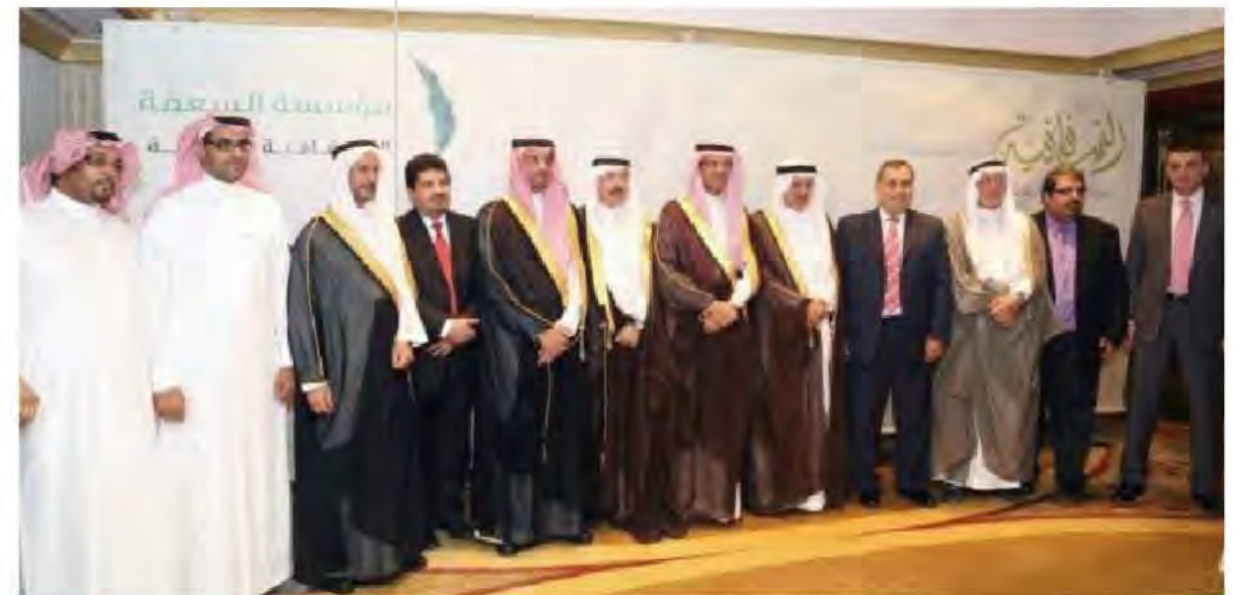
A souvenir photos of Al Majdouie team with judges team of Saafah reward.

The award, which was launched in 2002 as recognition to the institutions that promote the principle of transparency, and enhance the values by tightening their internal regulations and internal control procedures. That have positive impact both inside and outside the perimeter of their work.