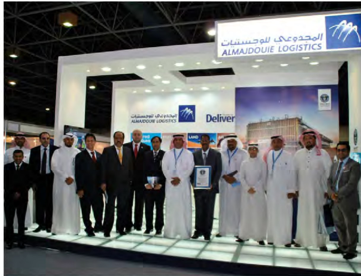
Logistics Western Region Team – At Jeddah Ports Exhibition

On the other hand many government bodies represented at the event like Coast Guard, Saudi Aramco, etc.