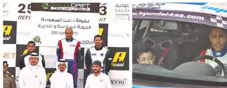
All the best to ALMAJDOUIE team in the next contest (Red ball Drift Park) which is for the whole

In one of the rounds, he was a companioned by one of the handicapped.