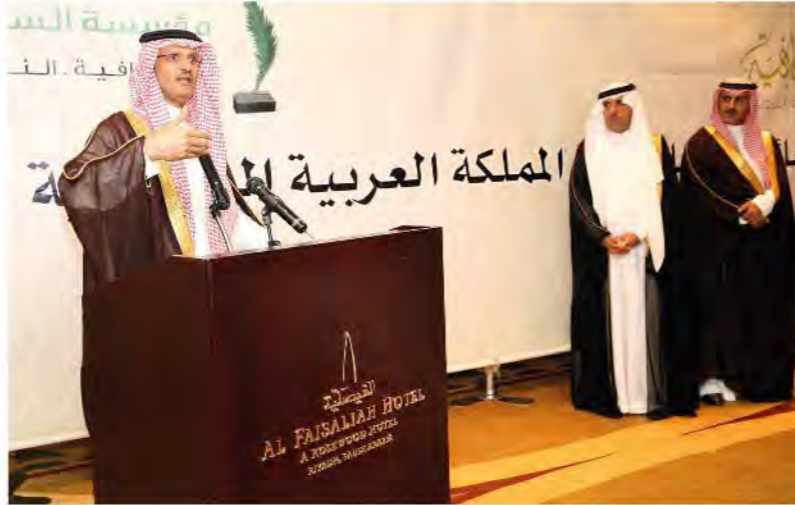
The PRS of Al Majdouie Group given speech after the group reward

The Jury has praised the exclusive policies and internal systems adopted by Almajdouie Group, including the Group focusing on the development of different and coherent regulations for the Contracts and Procurement activities. And caring for integration of policies and regulations of the employees' rights and policies to deal