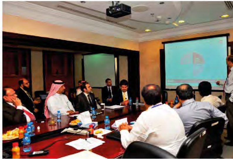
During May 2013, eleven sessions were conducted by EMAD and HCL team to demonstrate the Detailed Business and system objectives for all logistics and MAJD real estate development and its sub divisions as follows:

This will be followed by Demonstration sessions to be held in June 2013. The Oracle standard process will be shown directly on the system. The expected output of the Demonstrations is to update the process listing, initial Gap list and future structure.