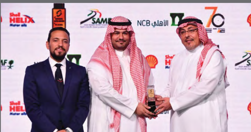
Almajdouie - Changan named 'Most Sophisticated Brand in Saudi Arabia'

MAJD Development Co. sign agreement to introduce the Courtyard by Marriot Brand in Jubail