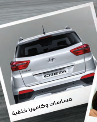
حساسات وكاميرا خلفية