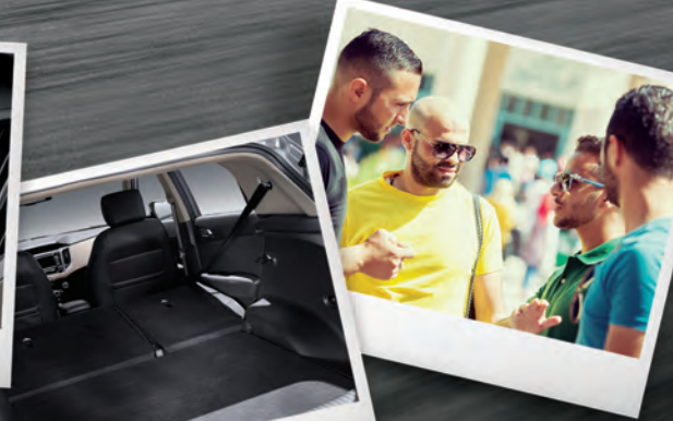
مساحة تخزين واسعة