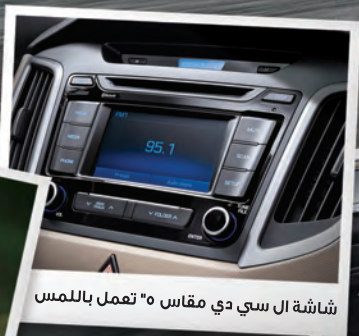
شاشة ال سي دي مقاس ٥* تعمل باللمس